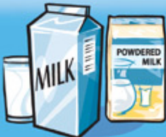
Milk or powdered milk (reconstituted) 250 mL (1 cup)