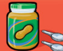
Peanut or nut butters 30 mL (2 Tbsp)