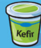
Kefir 175 g (¾ cup)