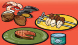
Cooked fish, shellfish, poultry, lean meat 75 g (2 ½ oz.)/125 mL (½ cup)