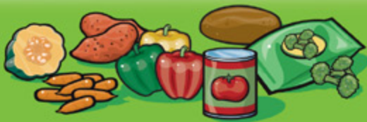
Fresh, frozen or canned vegetables 125 mL (½ cup)