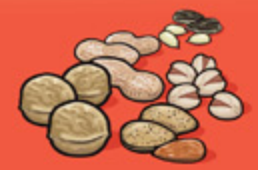
Shelled nuts and seeds 60 mL (¼ cup)